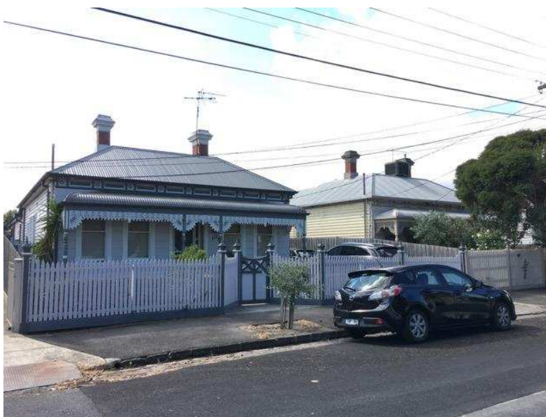
Tinning Street Precinct - nos. 110 and 112

Recommended Heritage Protection VHR - HI - PS Yes