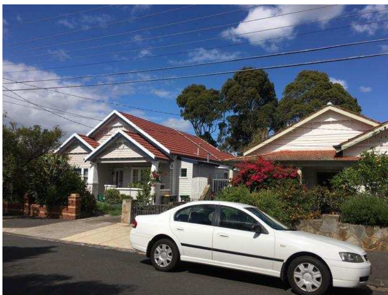
Hickford Street Precinct

Recommended Heritage Protection VHR - HI - PS Yes