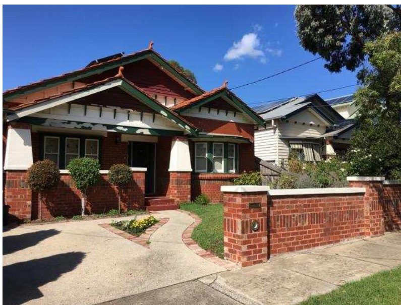
Meaker Avenue Precinct

Recommended Heritage Protection VHR - HI - PS Yes