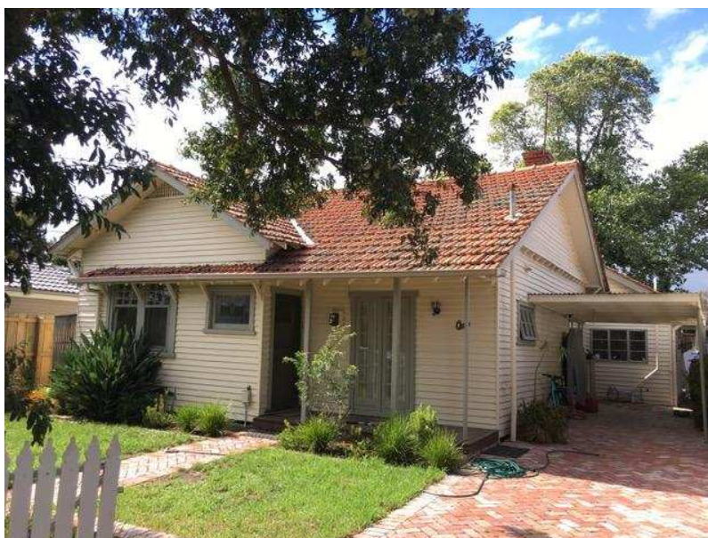
War Service Timber Homes - 1 Pareora Ave