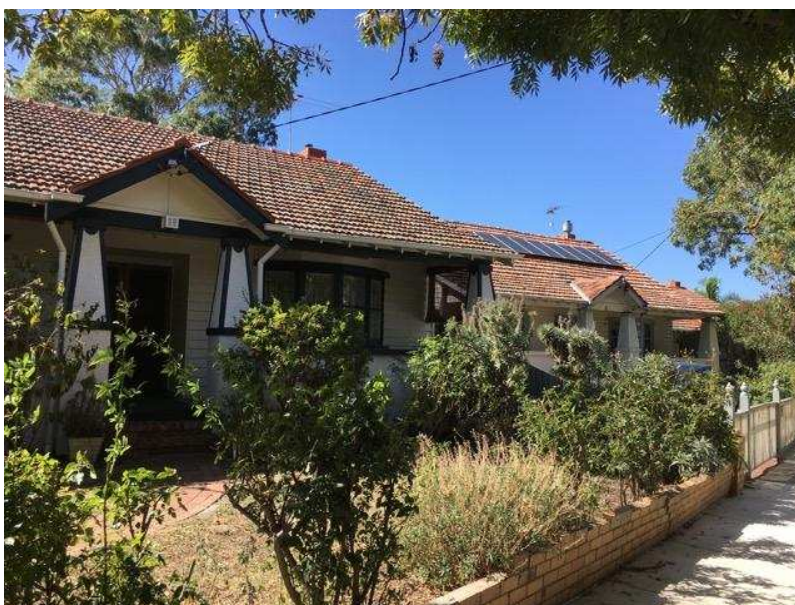
Waxman Parade Precinct

Recommended Heritage Protection VHR - HI - PS Yes