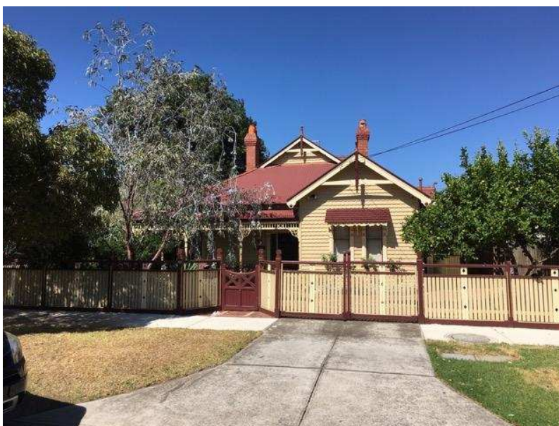
Closer Settlement House - 43 Waxman Pde

Name Closer Settlement Houses Address 18, 37, 43 & 51 WAXMAN PDE, BRUNSWICK WEST 19, 23 & 32 PASSFIELD ST, BRUNSWICK WEST 280 & 284 HOPE ST, BRUNSWICK WEST 30 MURRAY ST, BRUNSWICK WEST 46 & 47 CUMMING ST, BRUNSWICK WEST 5 BALFE CRES, BRUNSWICK WEST 6 & 10 ALLARD ST, BRUNSWICK WEST 7 HOPETOUN AVE, BRUNSWICK WEST 9 MCCOLL CT, BRUNSWICK WEST Place Type House, Residential Precinct Citation Date 2017