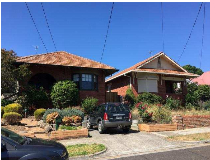
War Service Homes - 46 and 48 Shamrock St

Recommended Heritage Protection VHR - HI - PS Yes